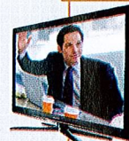
Samsung UE40C7000 £1800 ★★★★★