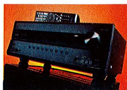
Onkyo TX-SR608 £450 ★★★★★

Channels/power 7/160W ● HDMI 1.4 Yes ● HDMI inputs 4 ● 3D capable Yes ● Network capable No ● Dimensions (hwd) 17 x 43 x 38cm ● Weight 10kg