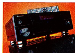
Pioneer VSX-920 £500 ★★★★★

Channels/power 7/160W ● HDMI 1.4 Yes ● HDMI inputs 6 ● 3D capable Yes ● Network capable No ● Dimensions (hwd) 18 x 44 x 33cm ● Weight 14kg