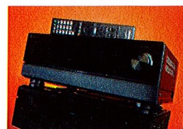
Sony STR-DN1010 £500 ★★★★★

Channels/power 7/140W ● HDMI 1.4 Yes ● HDMI inputs 4 ● 3D capable Yes ● Network capable Yes ● Dimensions (hwd) 16 x 42 x 38cm ● Weight 10kg