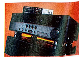
Yamaha RX-V667 £450 ★★★★★

Channels/power 7/100W ● HDMI 1.4 Yes ● HDMI inputs 4 ● 3D capable Yes ● Network capable Yes, with Sony kit ● Dimensions (hwd) 16 x 43 x 33cm ● Weight 9kg